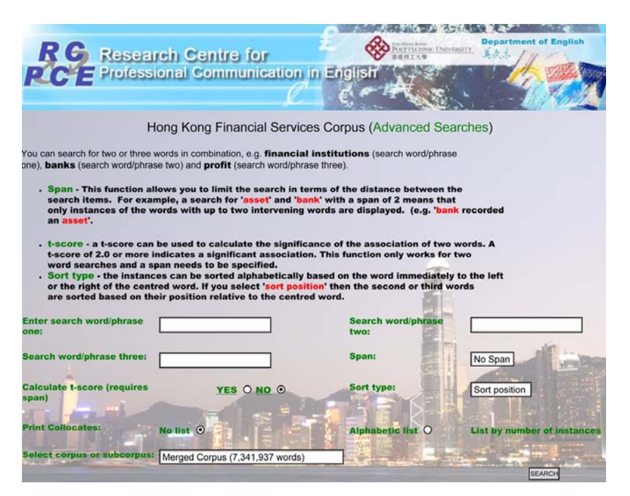
Figure 2: Advanced search functions

As can be seen in Figure 1, at the bottom of the page there are links to 'Advanced Searches and 'Search your own text'. The latter option allows users to upload their own text, or corpus, and then search it using ConcGramOnline. This facility allows users to take advantage of the innovative software to identify the phraseology, especially phraseological variation, in their own texts and corpora. Selecting 'Advanced Searches' takes the user to the page shown in Figure 2: