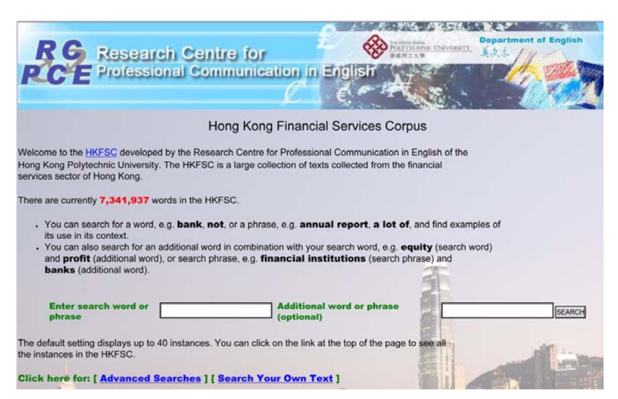
Figure 1: Basic search functions

As has been mentioned before, these two corpora are primarily aimed at engineering and financial services professionals who have no knowledge of corpus linguistics and no training in how to interrogate a corpus. With this in mind, the interface is designed to be as simple and as user-friendly as possible. The corpora are accessed by means of a link on the home page of our research centre which then takes the user to a list of the various corpora available. The user clicks on the corpus of choice and, by default, is taken to the page containing very basic search functions as shown in Figure 1: